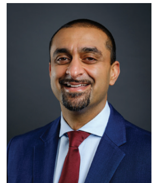
Ravi Kahlon Minister of Housing