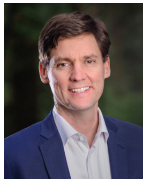
David Eby Premier

We've navigated a lot of challenges over the past few years, and we've made it through together. The actions in Homes for People will deliver more homes for people faster, and build a brighter future for everyone, in every community in B.C.